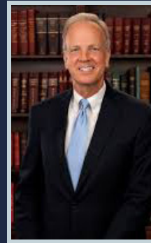
Jerry Moran U.S. Senator