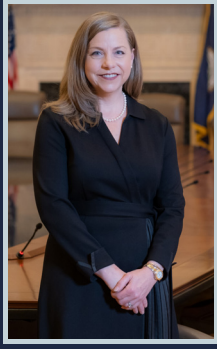
Miki Bowman Federal Reserve Board of Governors