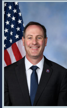
Tracey Mann U.S. Congressman