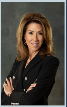
Tammie Jo Shults U.S. Navy Veteran & Retired Southwest Airlines Captain