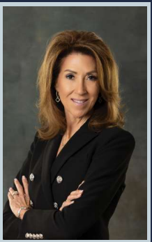
Tammie Jo Shults U.S. Navy Veteran & Retired Southwest Airlines Captain