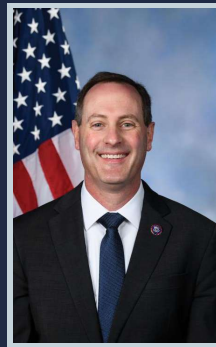
Tracey Mann U.S. Congressman