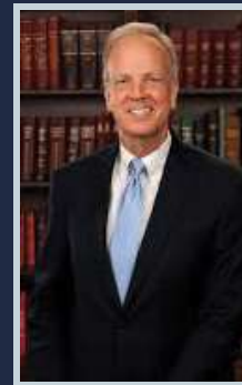
Jerry Moran U.S. Senator