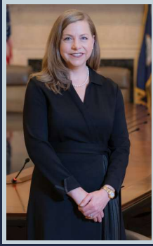
Miki Bowman Federal Reserve Board of Governors