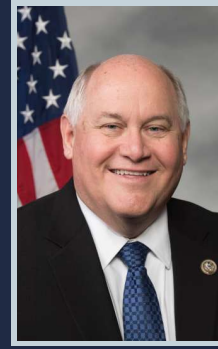
Ron Estes U.S. Congressman