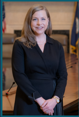
Miki Bowman Vice Chair for Supervision