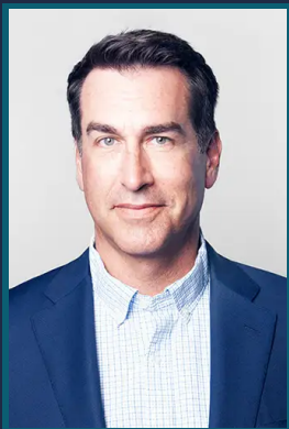
Rob Riggle American actor, comedian & U.S. Marine Corps Lieutenant Colonel