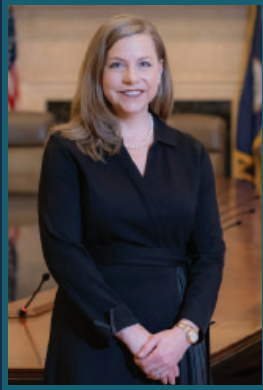
Miki Bowman Vice Chair for Supervision