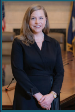
Miki Bowman Federal Reserve Governor