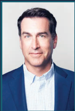
Rob Riggle American actor, comedian & U.S. Marine Corps Lieutenant Colonel