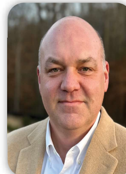
Austin Tucker Specialized Crop Insurance