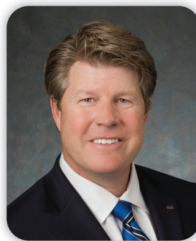
KC Mathews Commerce Trust