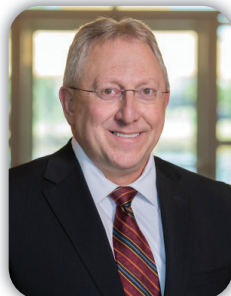
Stewart Weaver Foulston Siefkin LLP