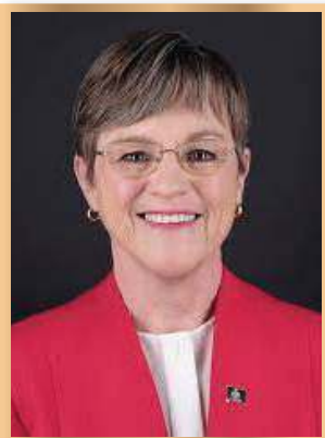
Laura Kelly Governor of Kansas